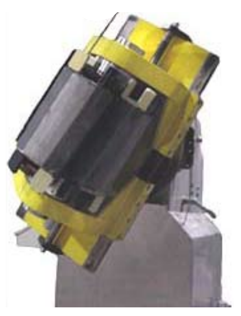
ASSEMBLY MOUNTED ON WINDING MACHINE