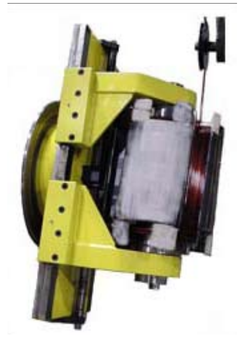
SALIENT POLE ROTOR MOUNTED IN TOOLING